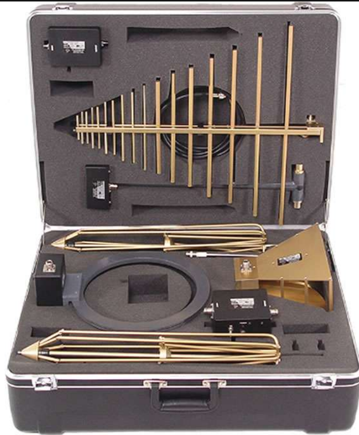
Shown with optional preamplifiers