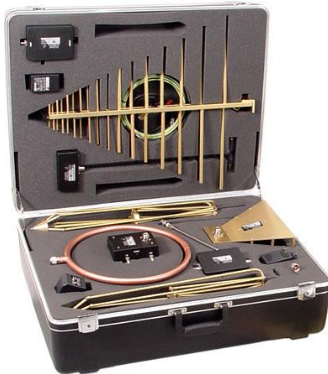
Shown with optional preamplifiers