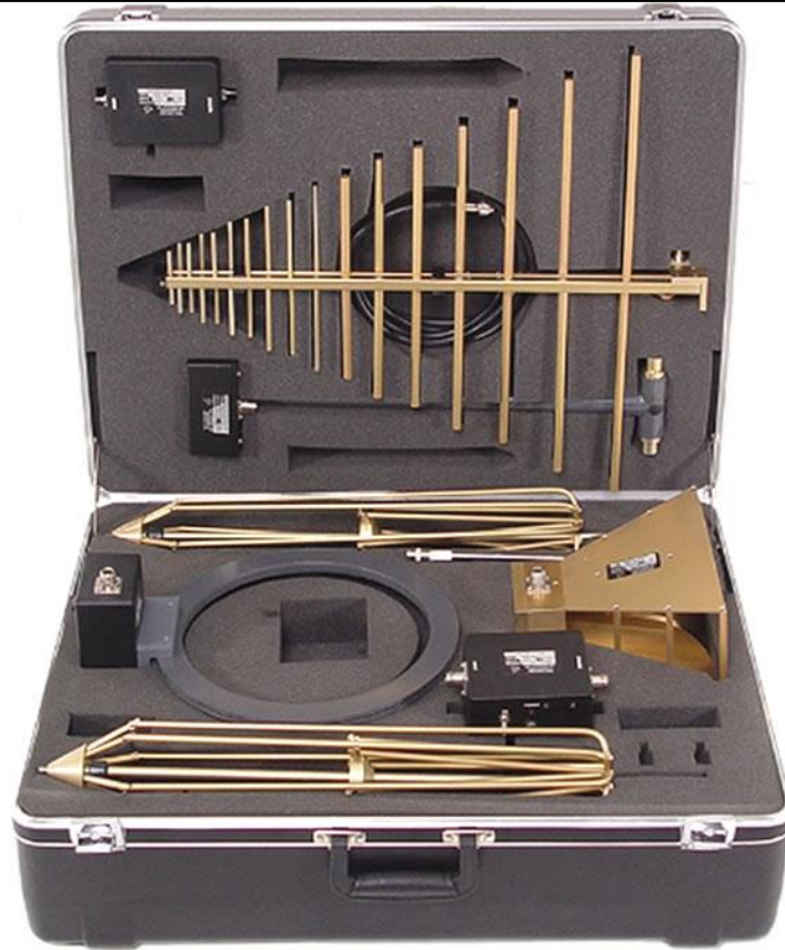
Shown with optional preamplifiers