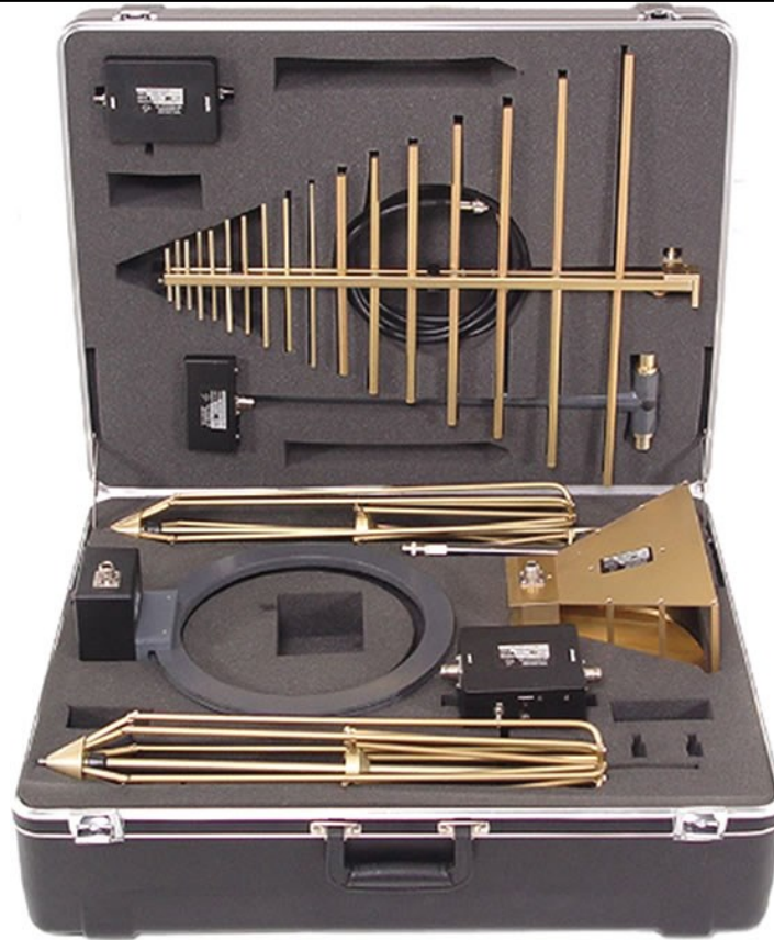
Shown with optional preamplifiers